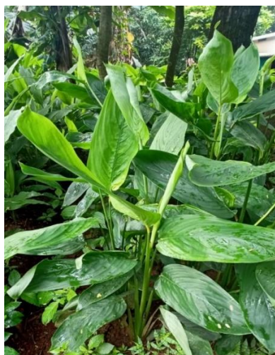
Figure 1 Maranta arundinacea Linn.