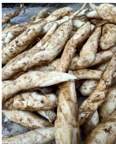
Figure 2 Rhizome of Maranta arundinacea Linn.