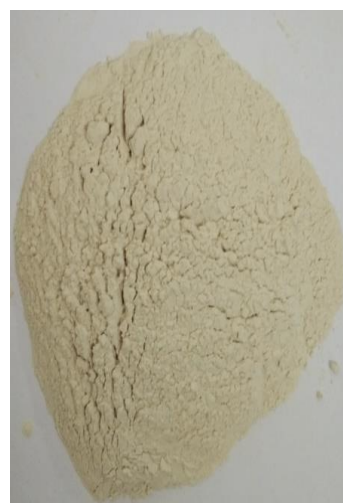
Figure 3 Dried rhizome powder of Maranta arundinacea Linn.