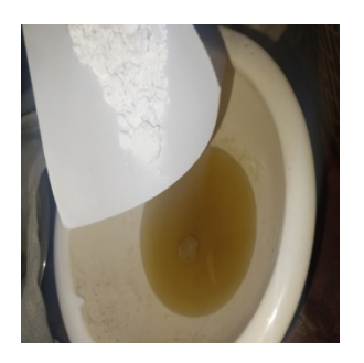
Fig.10: Addition of Tankana