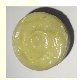
Fig.15: Tankana malahara 3