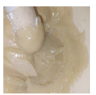
Fig.12: Homogenous mixture of tankana malahara