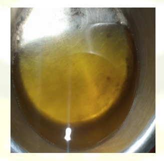
Fig.8: Siktha Taila