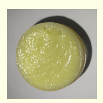
Fig.14: Tankana malahara 2