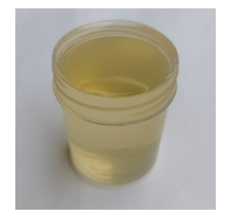
Fig.3: Narikela Taila