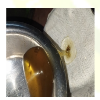
Fig.7: Filtration of Siktha Taila