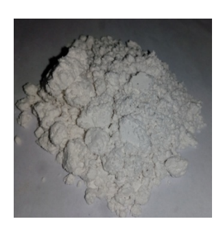
Fig.1: Shuddha Tankana