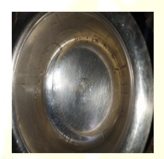
Fig.4: Heating Narikela Taila