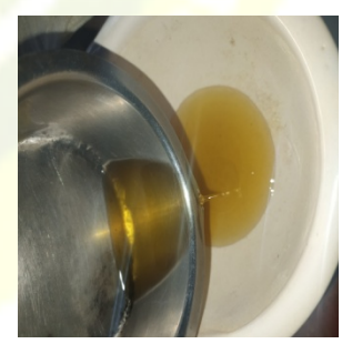
Fig.9: Molten Siktha Taila