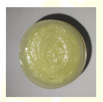
Fig.13: Tankana malahara 1