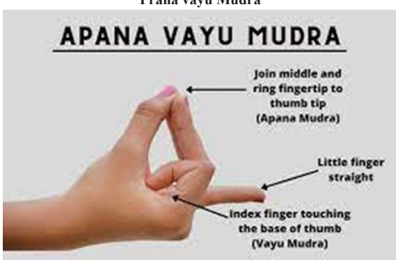
Apana Vayu Mudra/Hridya Mudra