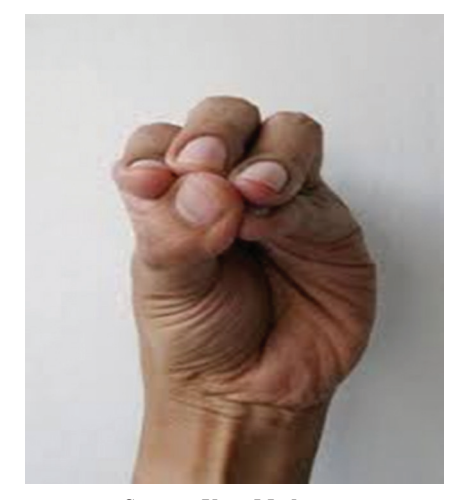
Samana Vayu Mudra