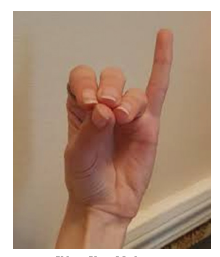
Udana Vayu Mudra