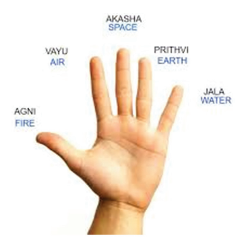
Representation of Pancha mahabhuta on Fingers