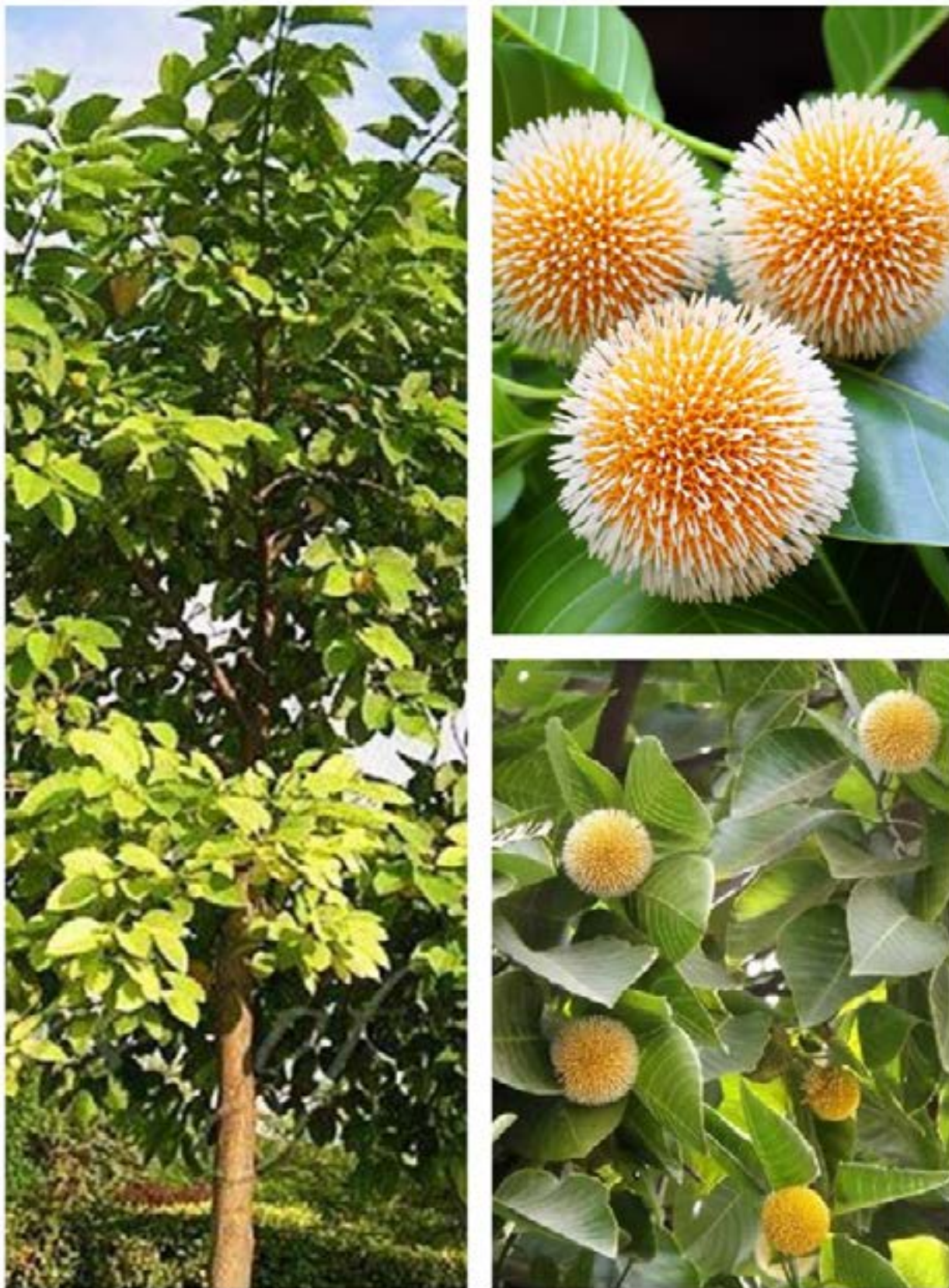
Figure 2: Neolamarckia cadamba Tree with Fruiting stage