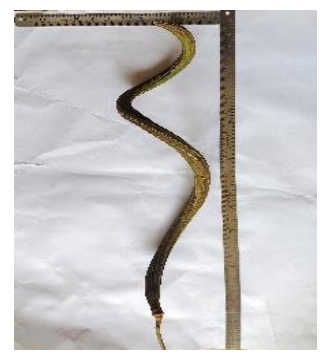
Fruit of H. adenophyllum