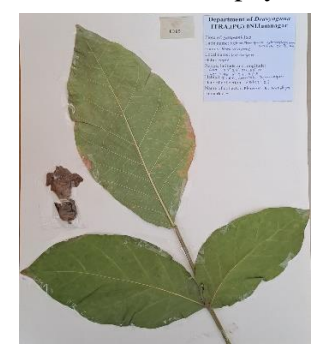
Herbarium of H. adenophyllum