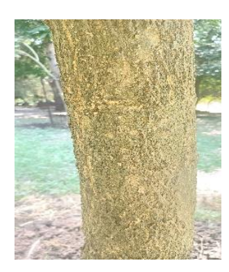
Bark of H. adenophyllumm