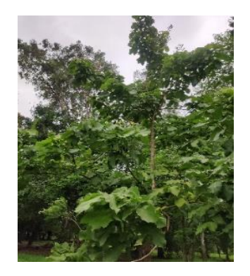
Whole plant of H. adenophyllum