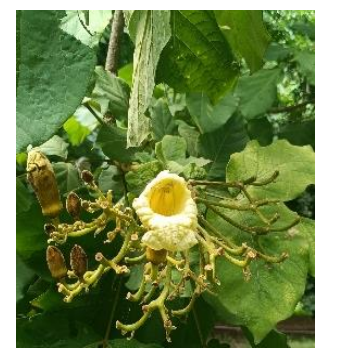
Flower of H. adenophyllum