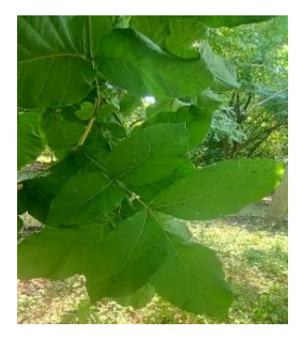
Leaves of H. adenophyllum