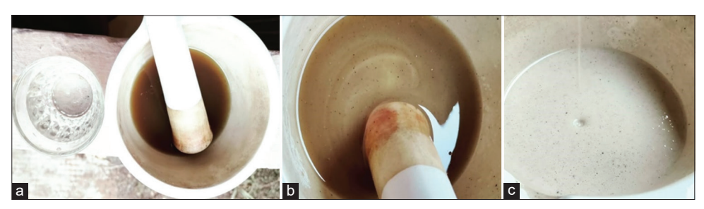
Figure 2: Preparation of Khajita Aranaladi taila . (a) Ingredients of Khajita Aranaladi taila . (b) During the preparation of Khajita Aranaladi taila . (c) After 1 h of grinding