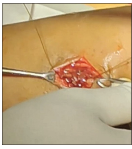
Figure 4: The dead space under the skin sutured by interrupted suturing