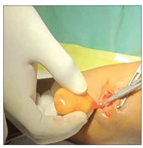
Figure 2: Dissection performed under lipoma