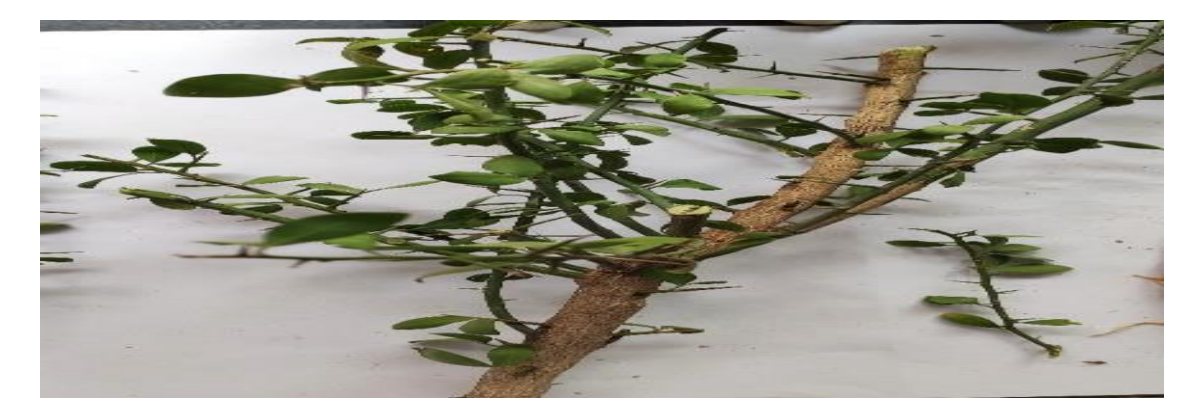
Fig 1: Leaf of Ingudi with Stem