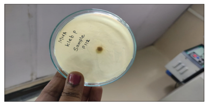
Picture 4: Distribution of zone of inhibition of sample drug against Klebsiella pneumoniae