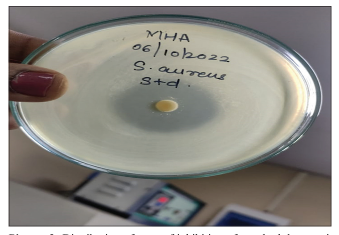
Picture 3: Distribution of zone of inhibition of standard drug against Staphylococcus aureus