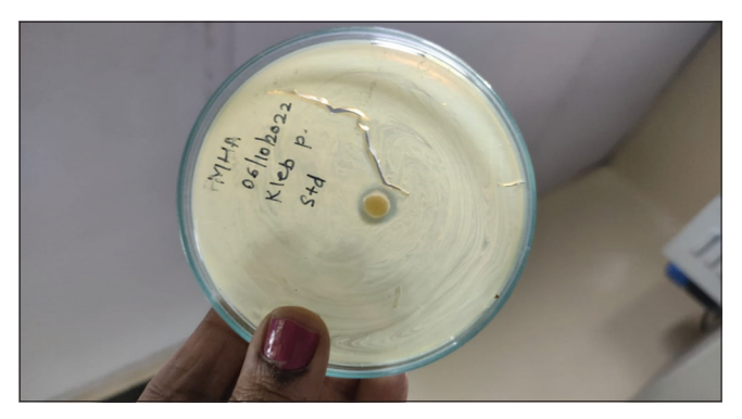
Picture 5: Distribution of zone of inhibition of standard drug against Klebsiella pneumoniae