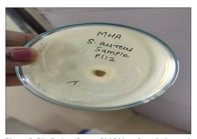
Picture 2: Distribution of zone of inhibition of sample drug against Staphylococcus aureus